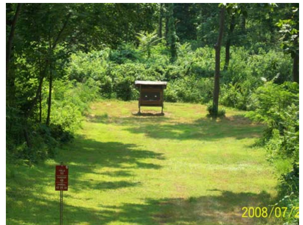
Wide shooting lanes and an example of the target sign and target butt.

The Mechanicsburg Archers will also be holding a Penn-Dutch League shoot June 20 & 21, 2009. This shoot is 14 Field & 14 Hunter Targets both days. This is a casual registration shoot from 7:00 A.M. to 11:00 A.M. both days.