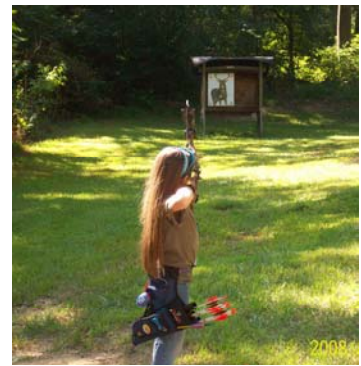
Youth at PSAA Animal Shoot. Target butts made of Celotex.

Our permanent courses have target butts made out of Celotex. Sometimes, depending on the type of arrows shot, this Celotex can leave a small residue on the shaft. Using an arrow lubricant to help prevent sticking and sometime even a steel pot scrubber to remove the residue can be beneficial.