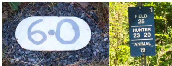
Examples of yardage markers in the ground and target number signs with yardages. Each course has its own color.